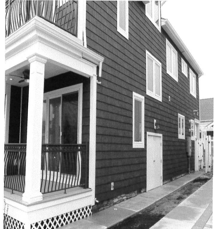
Rear View Date Taken:05/29/2009