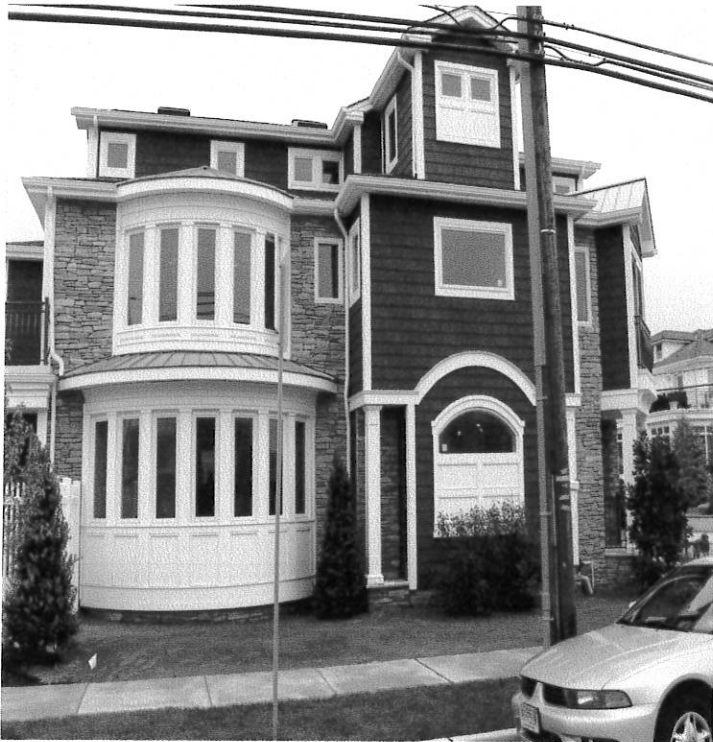
Front View Date Taken:05/29/2009