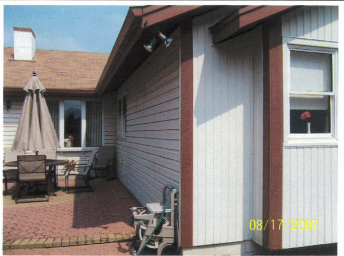
Left Side View – Date of Photograph: (See Photo Stamp)