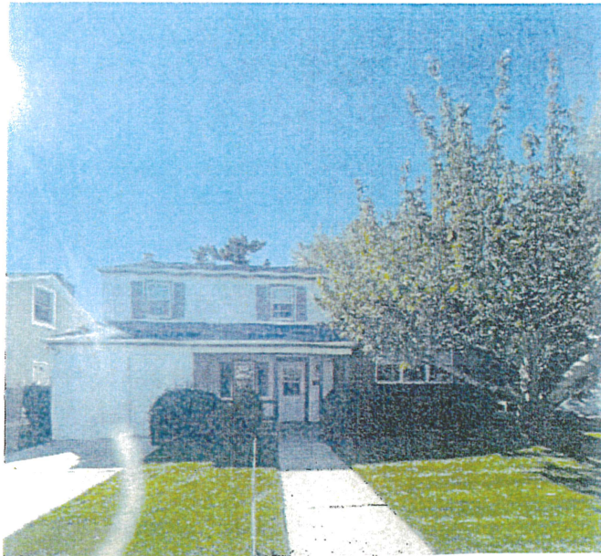
Photo One Caption Front View 10/29/2023

If using the Elevation Certificate to obtain NFIP flood insurance, affix at least 2 building photographs below according to the instructions for Item A6. Identify all photographs with date taken; "Front View" and "Rear View"; and, if required, "Right Side View" and "Left Side View." When applicable, photographs must show the foundation with representative examples of the flood openings or vents, as indicated in Section A8. If submitting more photographs than will fit on this page, use the Continuation Page.