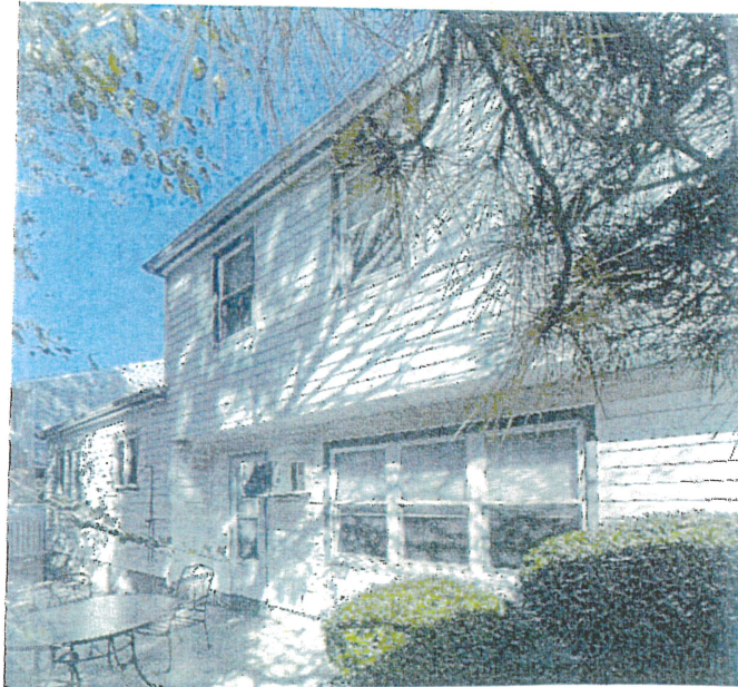
Photo Three Caption Rear View 10/29/2023

If submitting more photographs than will fit on the preceding page, affix the additional photographs below. Identify all photographs with: date taken; "Front View" and "Rear View"; and, if required, "Right Side View" and "Left Side View." When applicable, photographs must show the foundation with representative examples of the flood openings or vents, as indicated in Section A8.