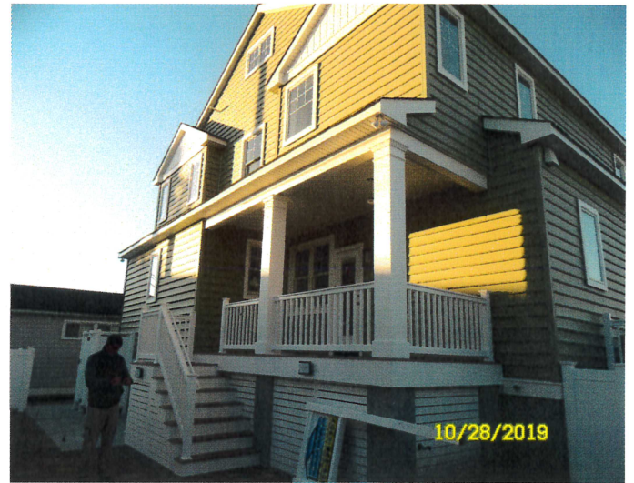
Rear View – Date of Photograph: (See Photo Stamp)