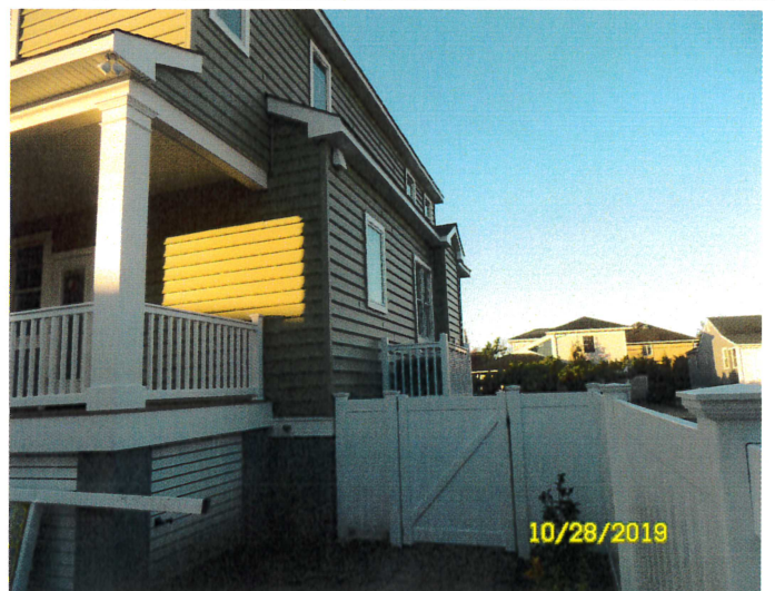
Left Side View – Date of Photograph: (See Photo Stamp)