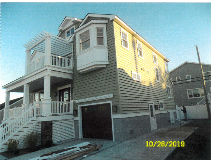
Right Side View – Date of Photograph: (See Photo Stamp)