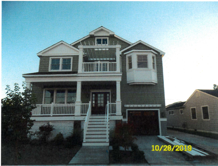
Front View – Date of Photograph: (See Photo Stamp)

If using the Elevation Certificate to obtain NFIP flood insurance, affix at least two building photographs below according to the instructions for Item A6. Identify all photographs with: date taken; "Front View" and "Rear View"; and, if required, "Right Side View" and "Left Side View." If submitting more photographs than will fit on this page, use the Continuation Page on the reverse.