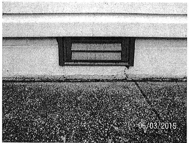
Vent View – Date of Photograph: (See Photo Stamp)