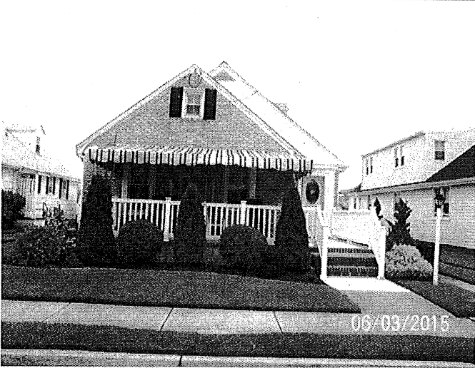
Front View – Date of Photograph: (See Photo Stamp)

If submitting more photographs than will fit on the preceding page, affix the additional photographs below. Identify all photographs with: date taken; "Front View" and "Rear View"; and, if required, "Right Side View" and "Left Side View."