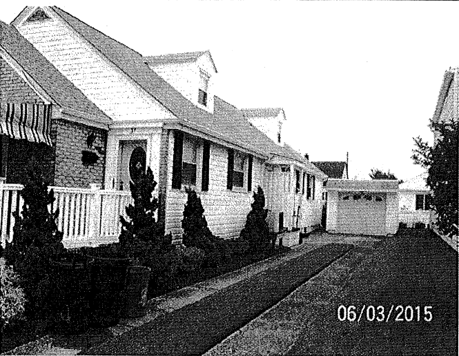
Right Side View – Date of Photograph: (See Photo Stamp)