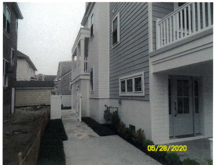
Right Side View – Date of Photograph: (See Photo Stamp)