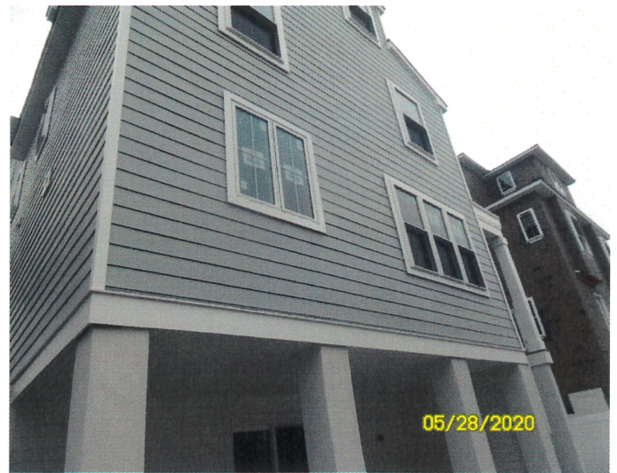
Front View – Date of Photograph: (See Photo Stamp)