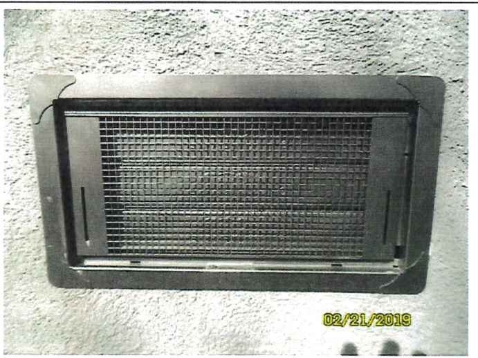
Vent View – Date of Photograph: (See Photo Stamp)