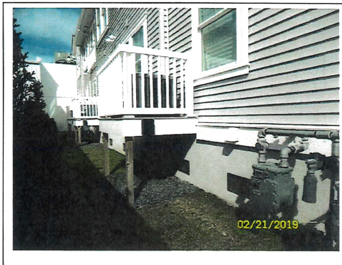
Rear View – Date of Photograph: (See Photo Stamp)