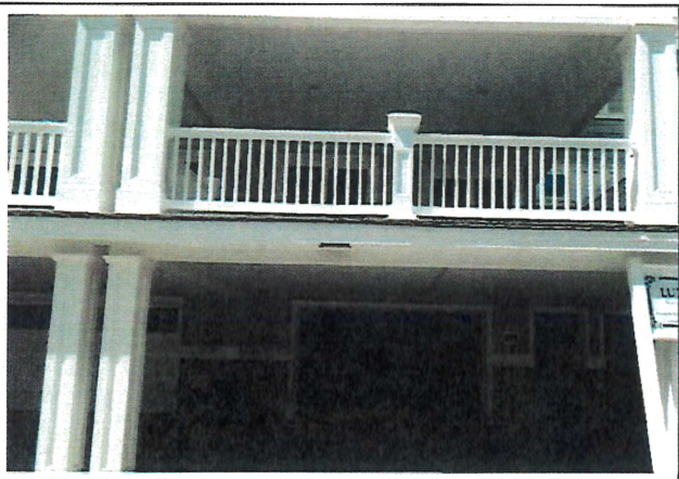
Front View – Date of Photograph: (02-21-2019)

If using the Elevation Certificate to obtain NFIP flood insurance, affix at least two building photographs below according to the instructions for Item A6. Identify all photographs with: date taken; "Front View" and "Rear View"; and, if required, "Right Side View" and "Left Side View." If submitting more photographs than will fit on this page, use the Continuation Page on the reverse.