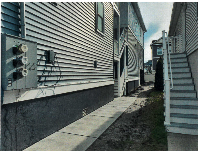
Rear View – Date of Photograph: (03-24-2020)