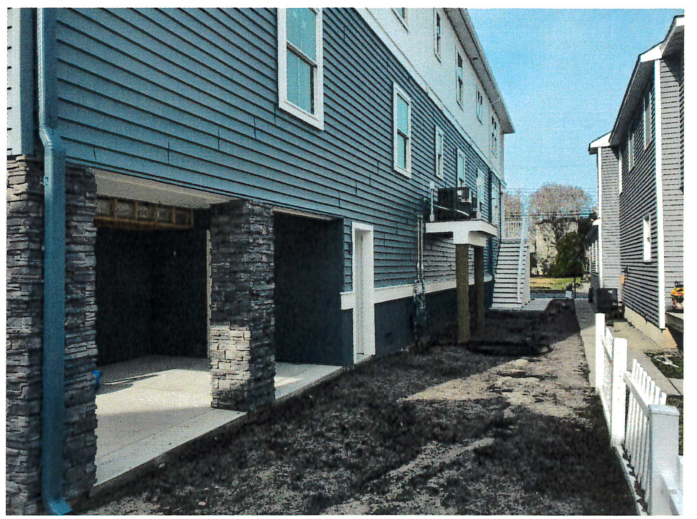
Right Side View – Date of Photograph: (03-24-2020)