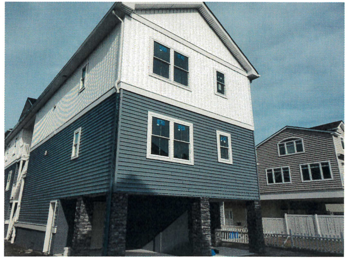
Front View – Date of Photograph: (03-24-2020)