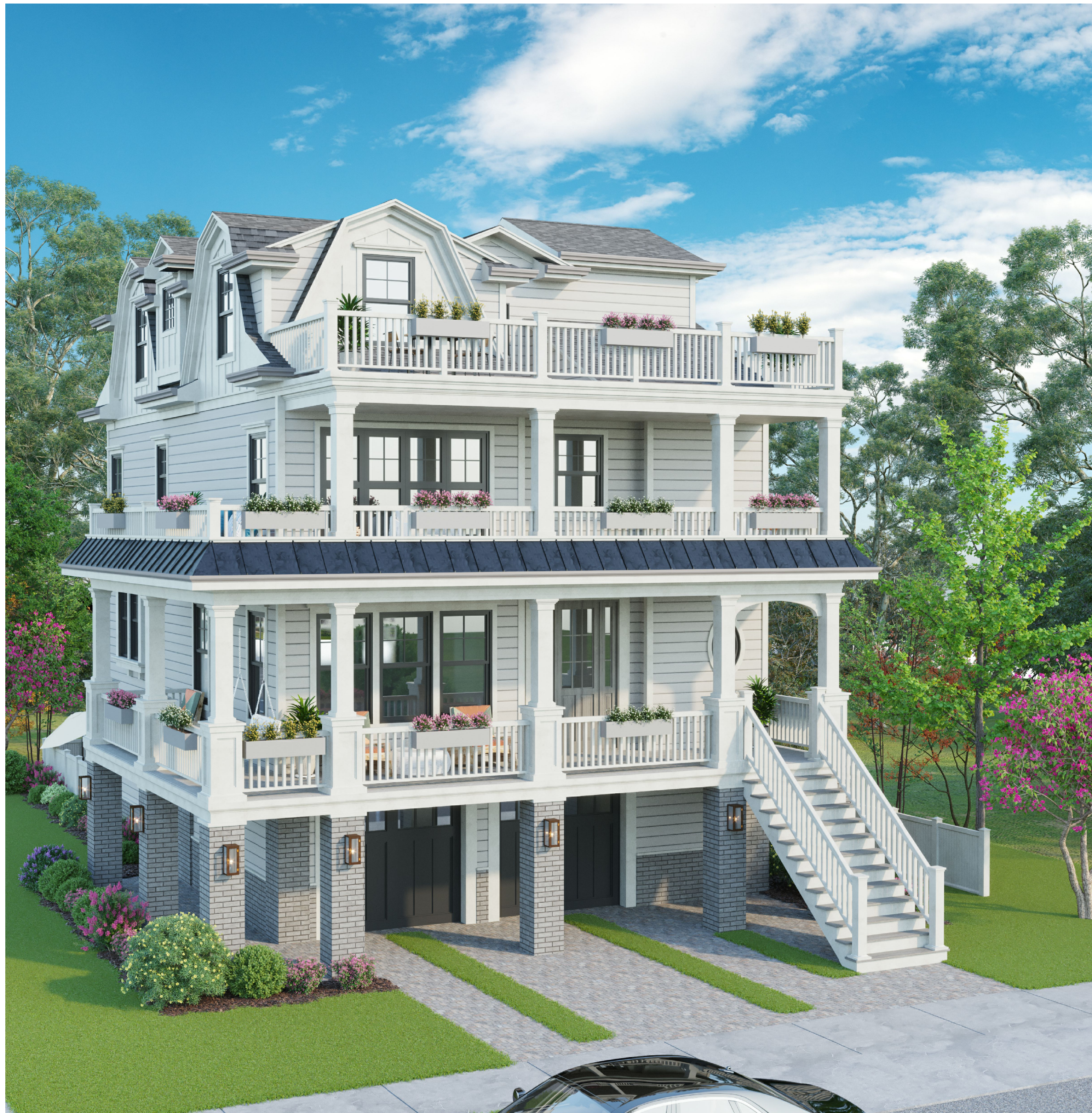
1 SUMNER AVE VP-3 SCALE: N.T.S.