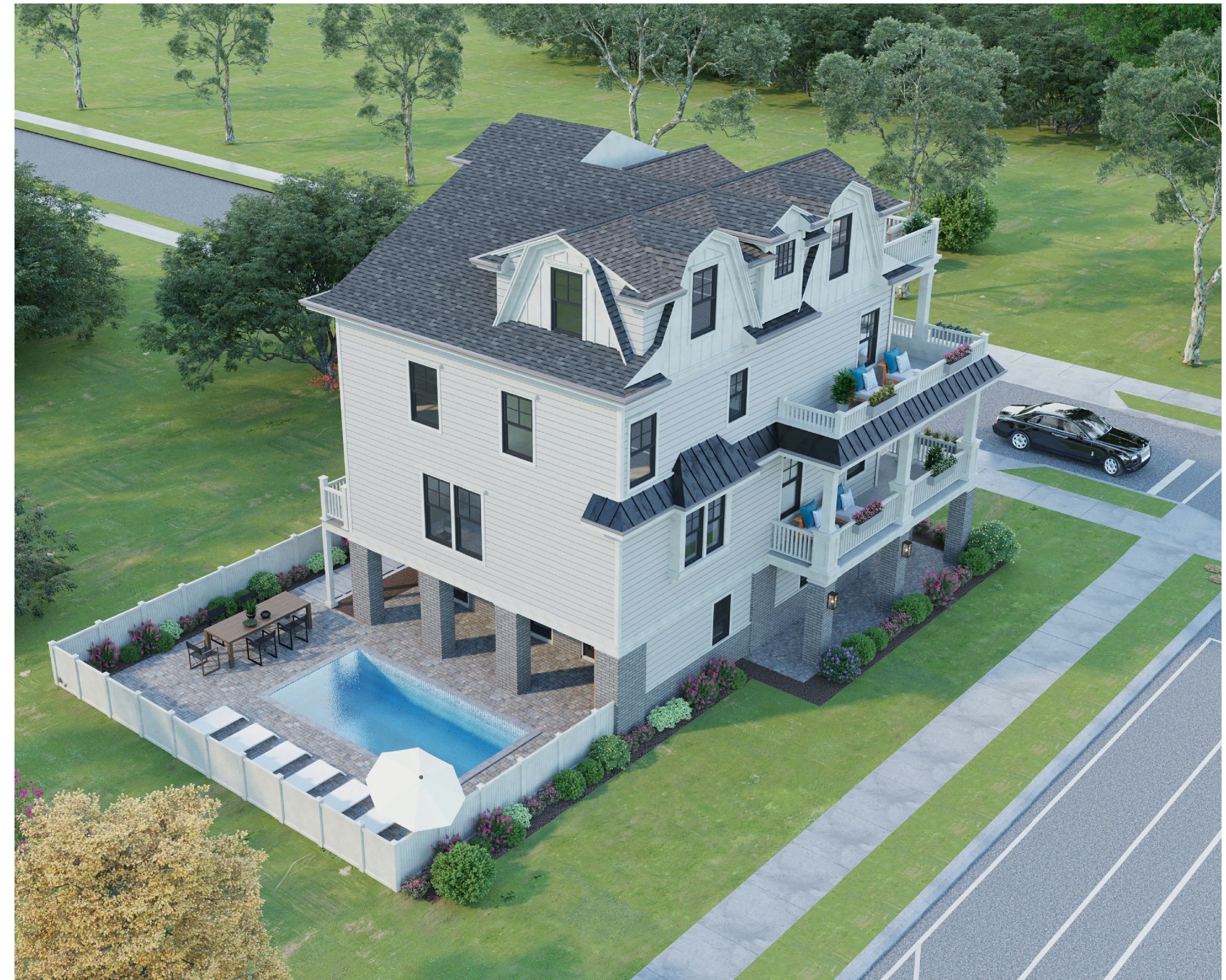
2 ATLANTIC AVE VP-3 SCALE: N.T.S.