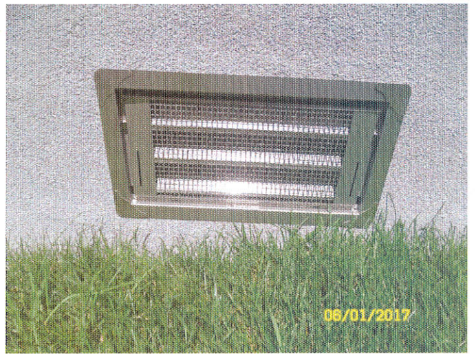
Vent View – Date of Photograph: (See Photo Stamp)