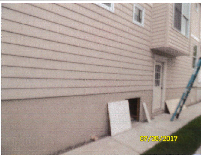
Left Side View – Date of Photograph: (See Photo Stamp)